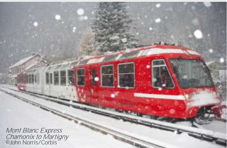
Mont Blanc Express Chamonix to Martigny