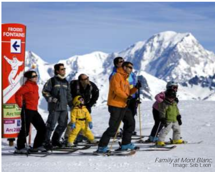
Family at Mont Blanc