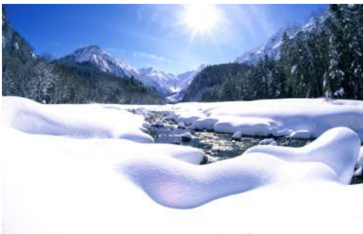
Trettachtal Valley.

For more information check out www.bavaria.by and www.bavarian-alps.travel