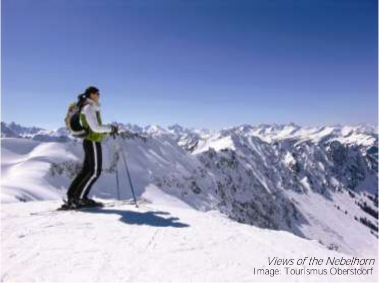
Views of the Nebelhorn