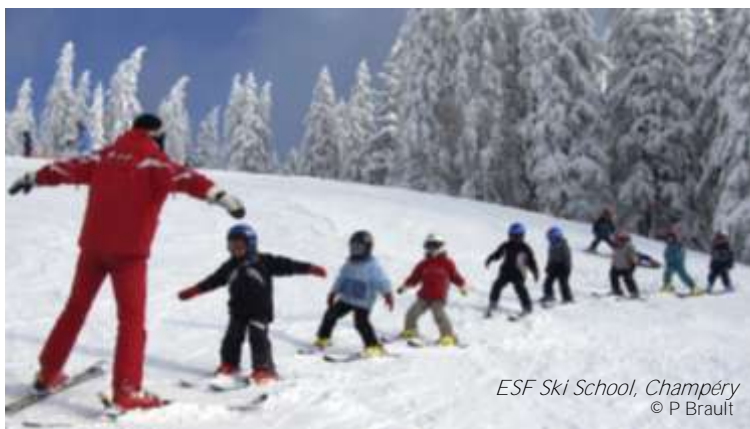
ESF Ski School, Champéry

T: 0041 (0)33 736 35 35 E: info@adelboden-lenk.ch W: www.adelboden-lenk.ch