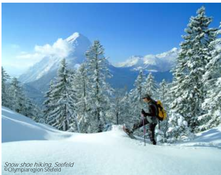
Snow shoe hiking, Seefeld

T: 0043 (0)5352 6335 0 E: info@kitzalps.cc W: www.kitzalps.cc