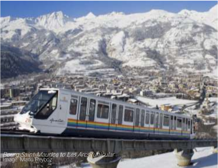
Bourg-Saint-Maurice to Les Arcs funicular

The 'France Montagnes' association was created in September 2009 in order to highlight and promote all the mountain regions of France, both nationally and internationally. This association is the main reference body for all winter resort businesses and commerce and its members include all tourism professionals within the winter sports industry. For the latest news and special offers go to www.france-montagnes.com