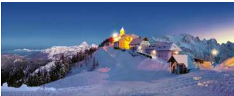
Santuario Monte Lussari

T: 0039 0428 2135 E: info.tarvisio@turismo.fvg.it W: www.turismo.fvg.it