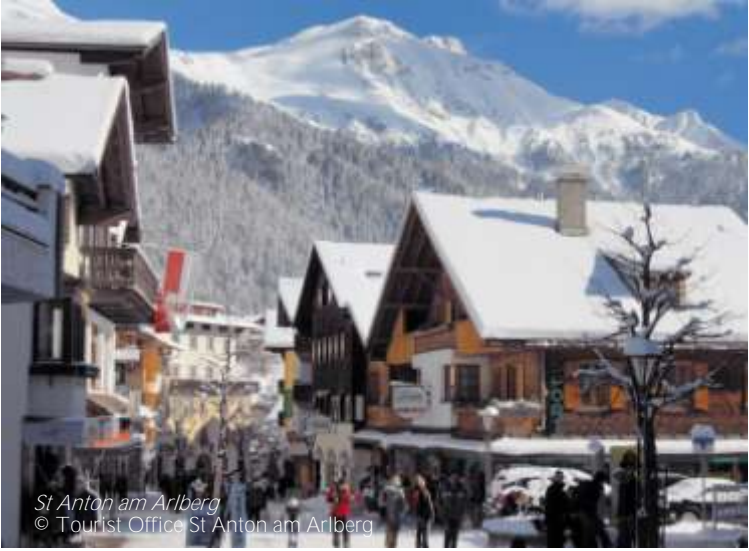
St Anton am Arlberg