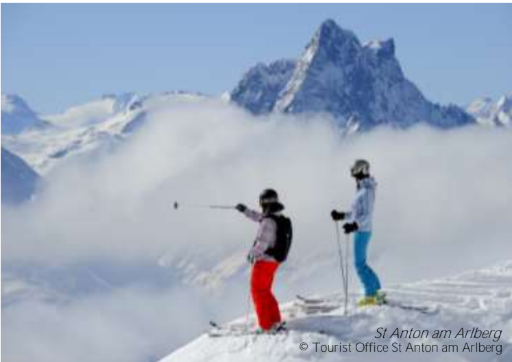
St Anton am Arlberg

For rail timetable information on rail journeys within Austria please contact the Holiday Service of the Austrian National Tourist Office on: 0845 101 1818.