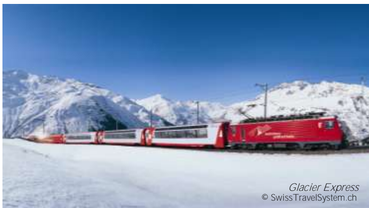
Glacier Express

For more information on Switzerland visit www.MySwitzerland.com