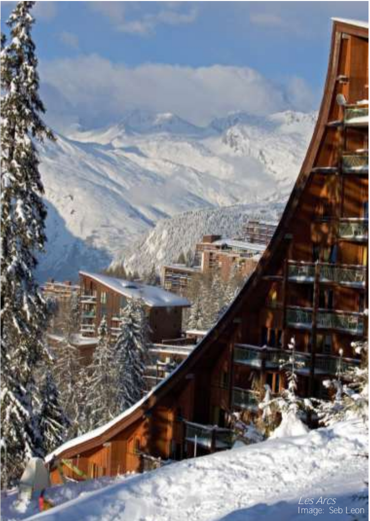
Les Arcs

T: 0033 (0)4 79 07 12 57 E: lesarcs@lesarcs.com W: www.lesarcs.com