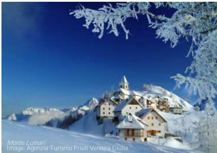
Monte Lussari