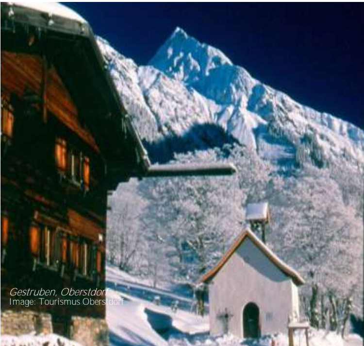
Gestruben, Oberstdorf

T: 0049 (0)8322 7000 E: info@oberstdorf.de W: www.allgaeu-airport.de, www.oberstdorf.de