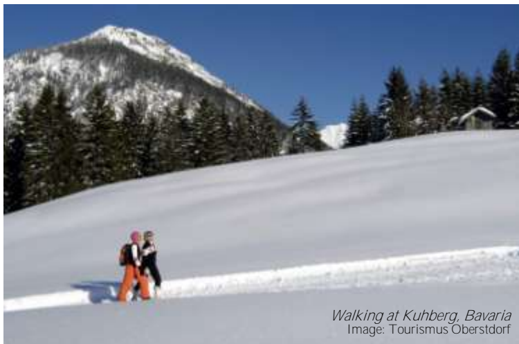
Walking at Kuhberg, Bavaria