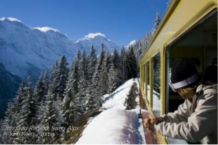
Jungfrau Region, Swiss Alps